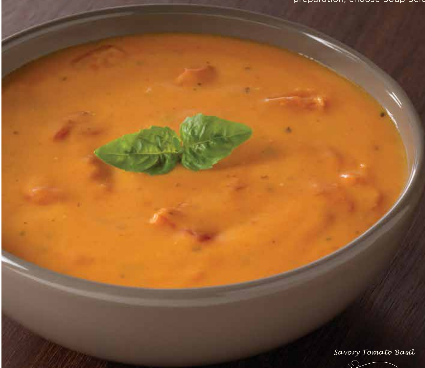
Savory Tomato Basil

Featuring bright colors and fresh flavor, Soup Select delivers consistently delicious results every time. The convenience of everything in one bag means all you do is cook and serve, nothing to add. When you want satisfying flavors, and quick preparation, choose Soup Select.