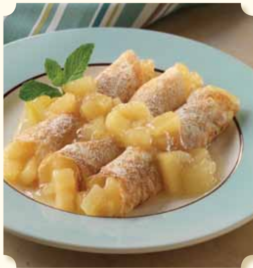
DICED APPLE Diced pieces of fresh-picked apple in a fine apple puree sparkled with hints of cinnamon and nutmeg.

Top desserts like ice cream and tarts, brighten breakfast standards like French toast and oatmeal, or plate one as a special accompaniment to a protein entrée. With Flav-R-Pac Fruit Topping, the possibilities are endless!