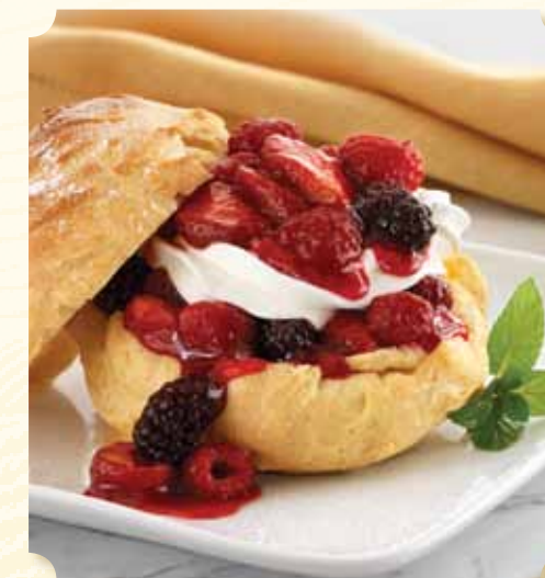
TRIPLE BERRY A berry lover's delight: strawberries, blackberries, and raspberries in a mixed berry sauce.