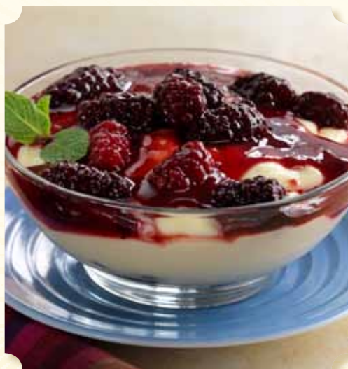
BLACKBERRY Plump blackberries in a sweet blackberry sauce that highlights fresh berry flavor.