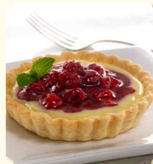
RASPBERRY Delicate, whole raspberries in an authentic sweet raspberry sauce.