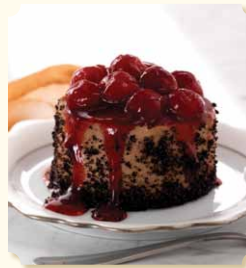
CHERRY Delectable tart cherries in a rich, sweet cherry sauce.