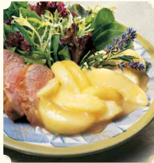
SLICED APPLE Tender wedges of sliced apples in a sauce of finely pureed apples seasoned with cinnamon and nutmeg.