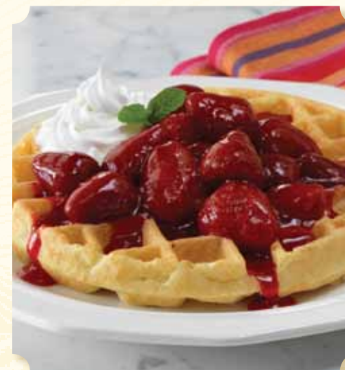
WHOLE STRAWBERRY Substantial whole strawberries in a vibrant strawberry sauce.