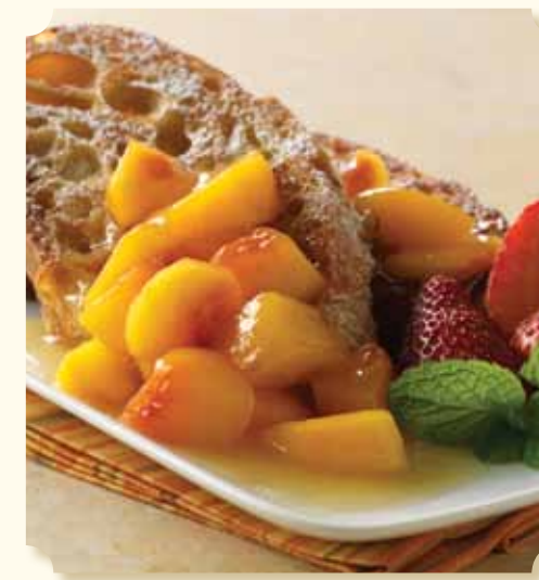
PEACH Bright, juicy peach chunks in a delicious fresh peach flavored sauce.