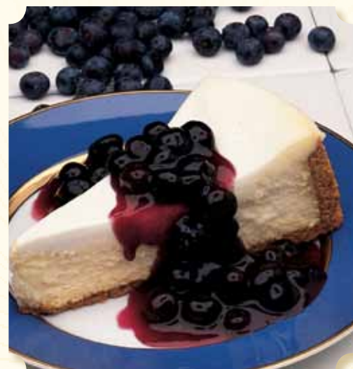
BLUEBERRY Fresh frozen blueberries picked at the peak of perfection in a sweet blueberry sauce.