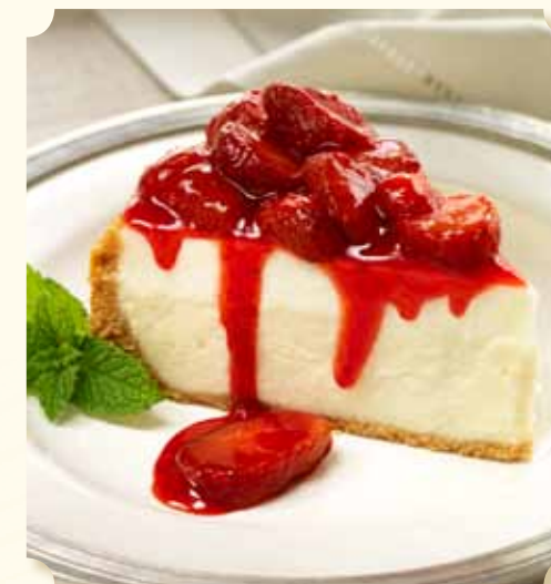
SLICED STRAWBERRY Perfect slices of strawberry in a smooth, sweet strawberry sauce.