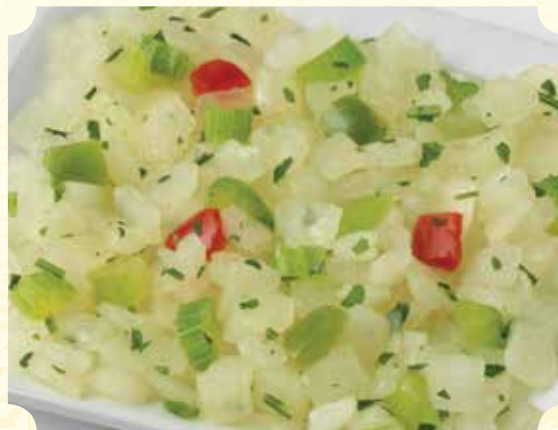
SEASONING BLEND Onions, Celery, Green Peppers, Red Peppers, and Parsley