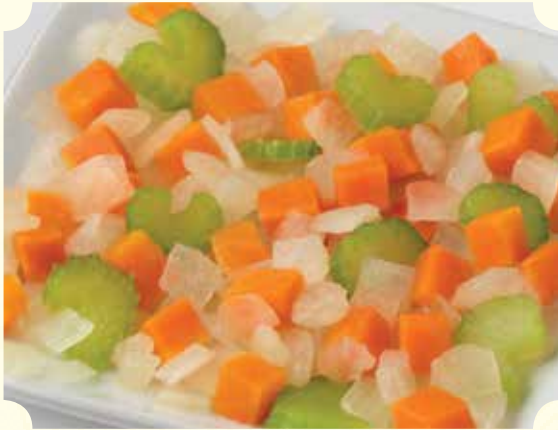
MIREPOIX BLEND Onions, Carrots, and Celery

Choose from Mirepoix Blend, Omelette Blend, or Seasoning Blend and have confidence that your dish is off to a great start.