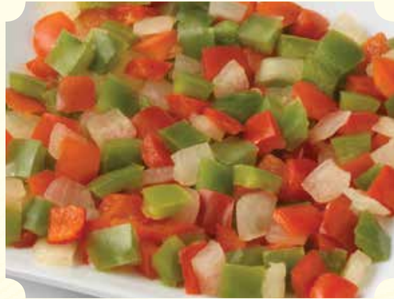
OMELETTE BLEND Onions, Red Peppers, and Green Peppers